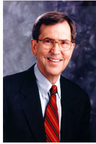
Pasadena Mayor Bill Bogaard